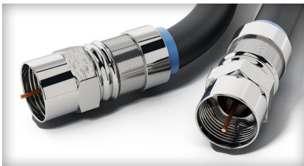
Coaxial Cables Assemblies