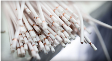
Wire Cut & Stripping Solutions