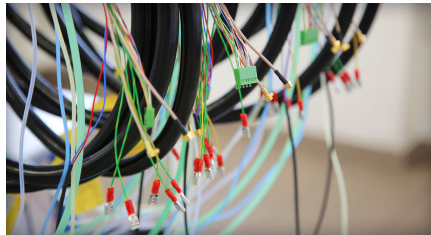
Custom Kitting Solutions