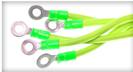
Crimp Connection Assemblies