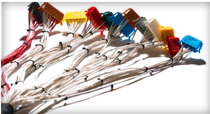
Wiring Harness Assemblies