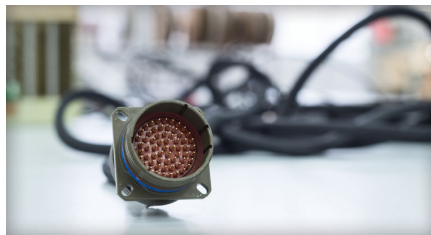
Circular Military Connector Assemblies